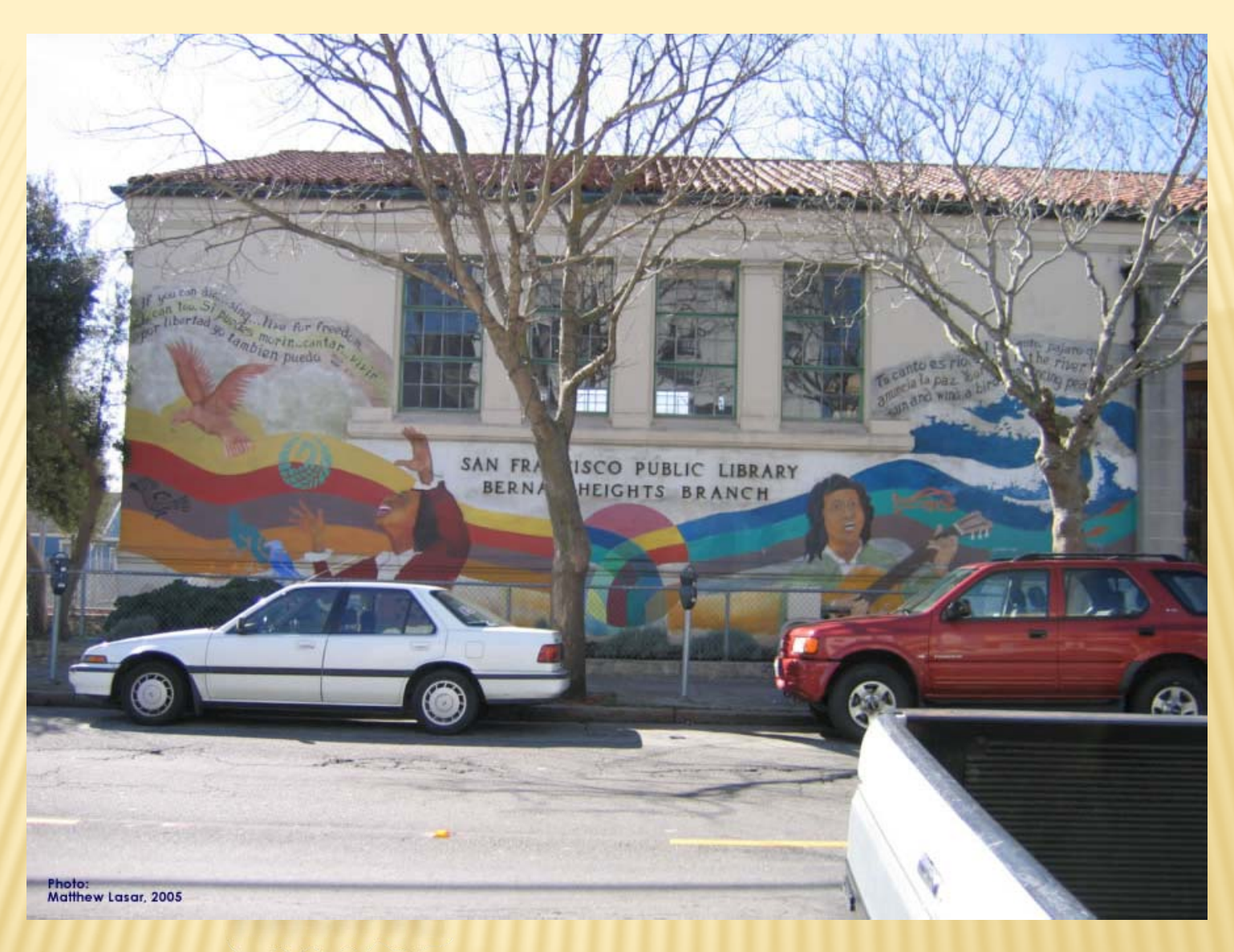
Bernal Mural - Cortland Street Facade