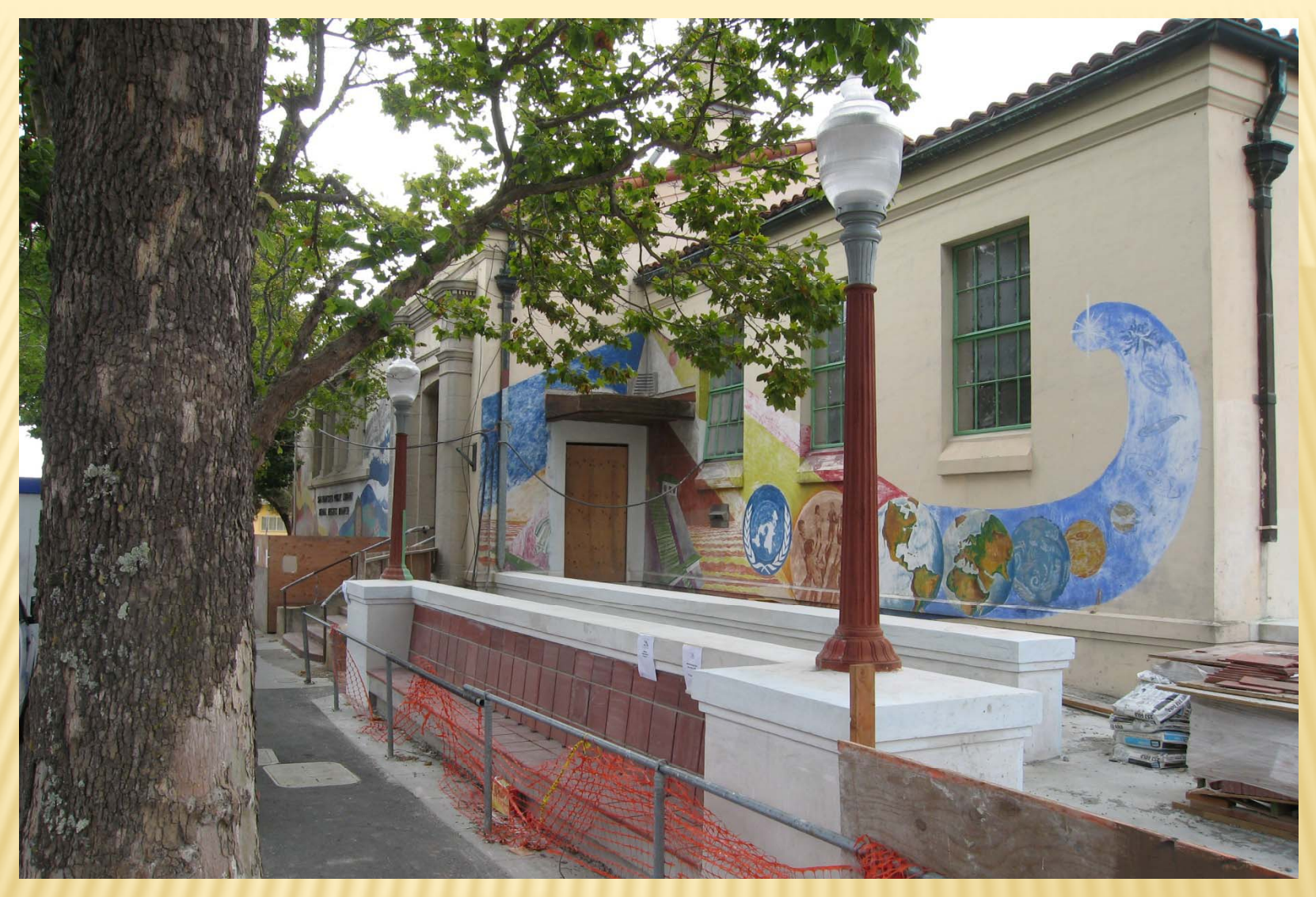
Bernal Mural - Cortland Street Facade