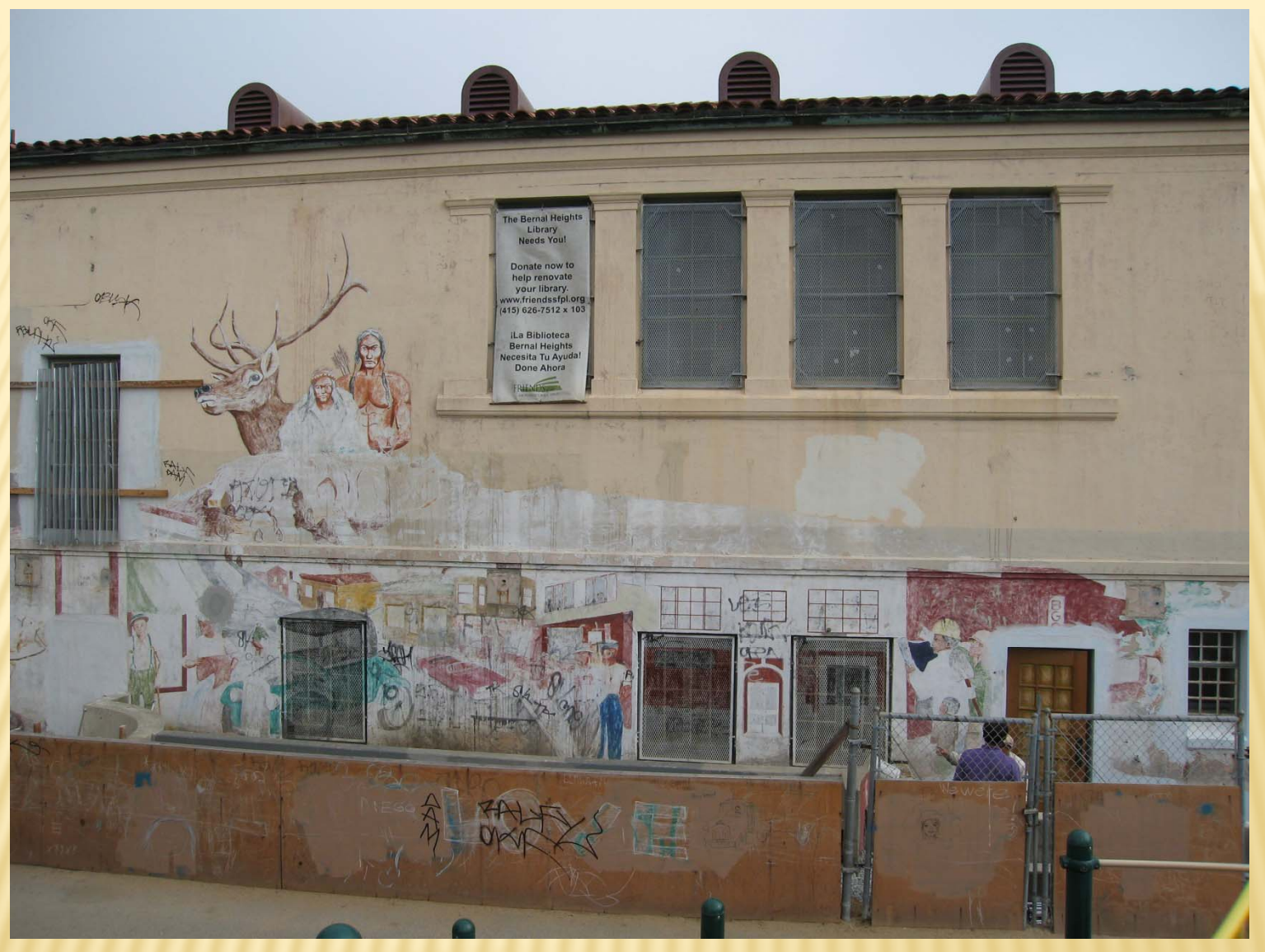
Bernal Mural – South Side Facing playground