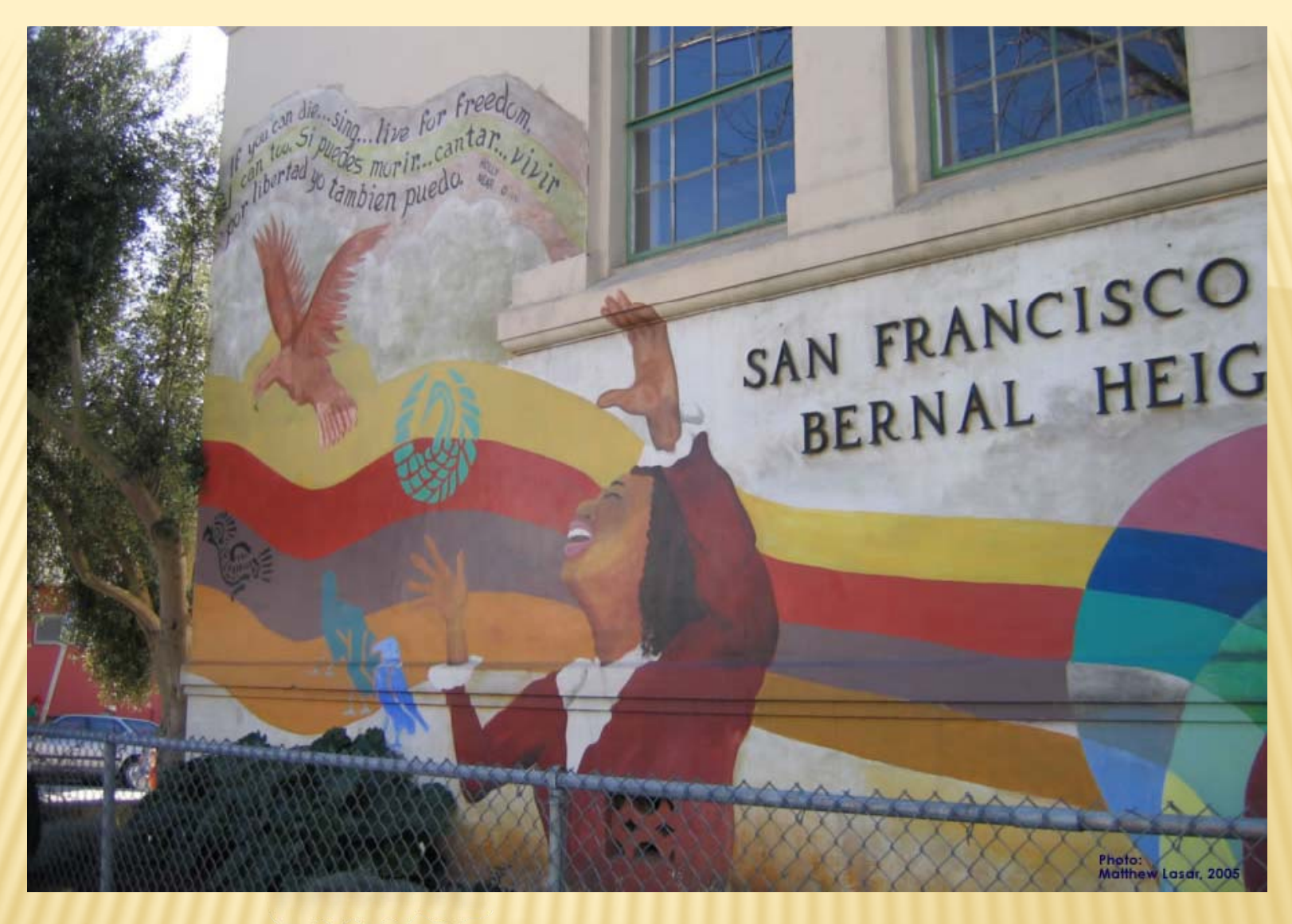
Bernal Library Mural - Cortland Street Facade