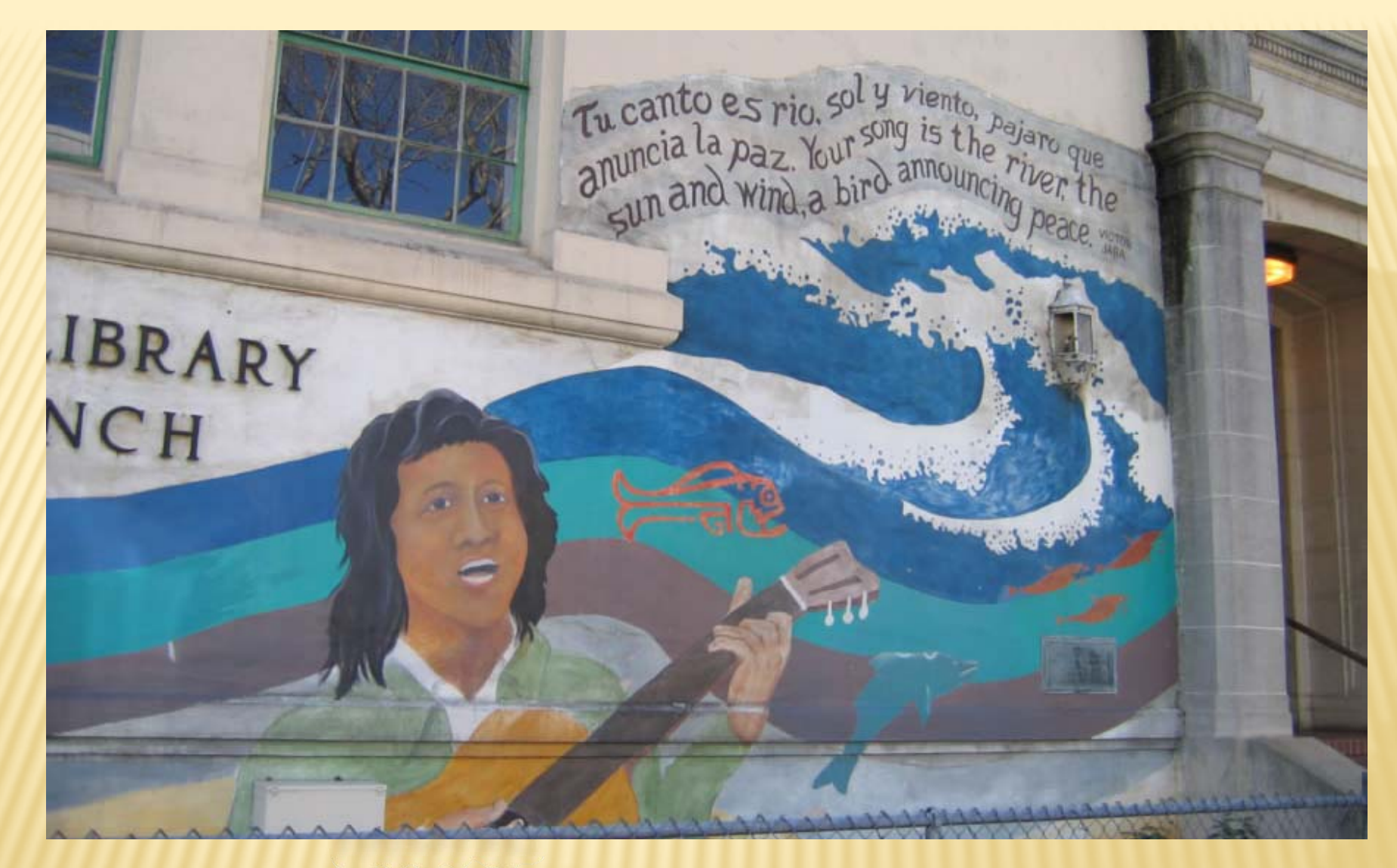
Bernal Mural - Cortland Street Facade