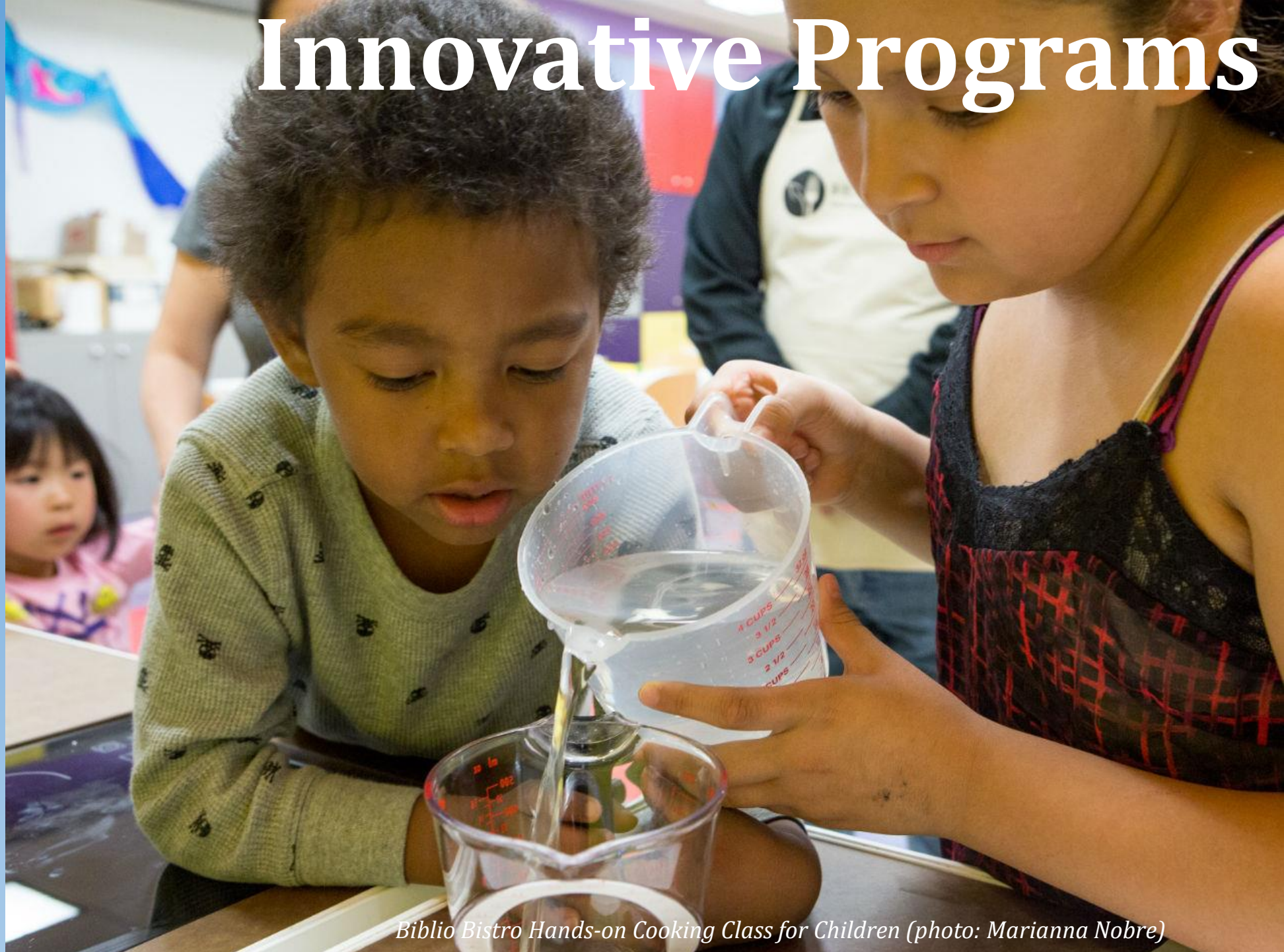
Biblio Bistro Hands-on Cooking Class for Children