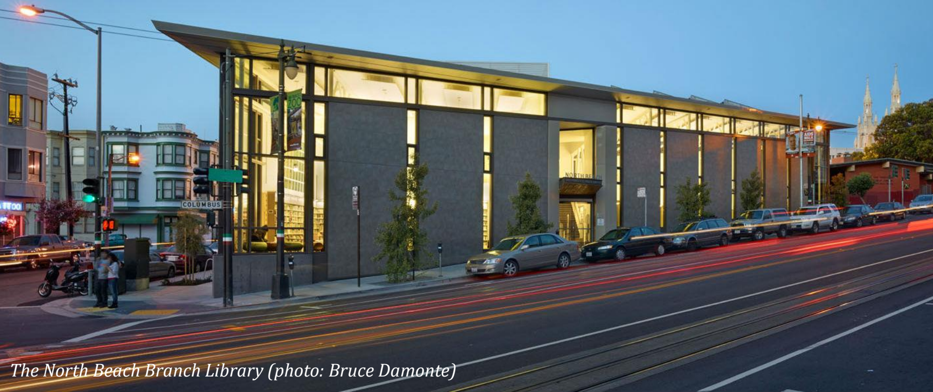
The North Beach Branch Library