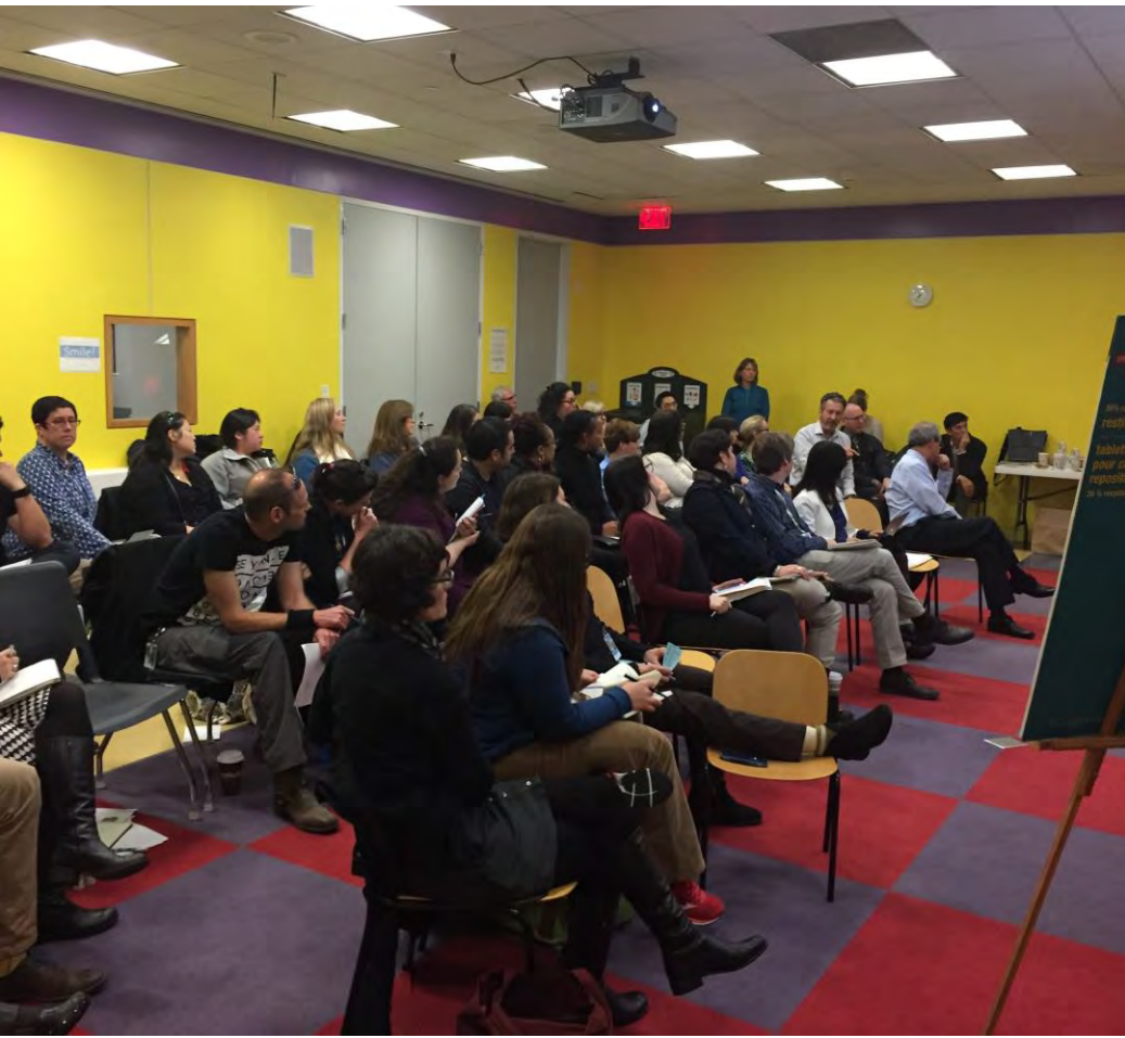
Employee Engagement Community Listening Tour