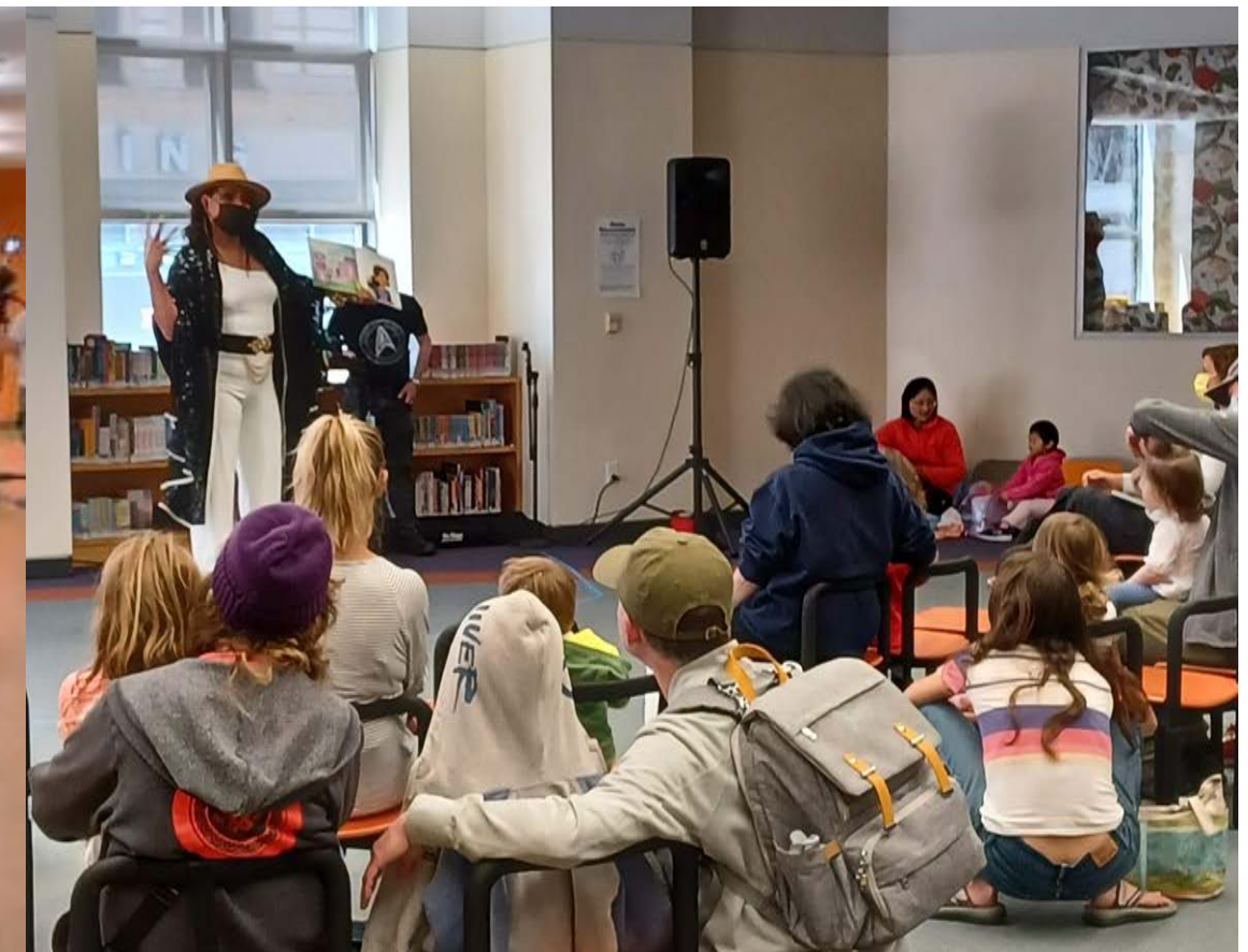
Drag Queen Story Hour