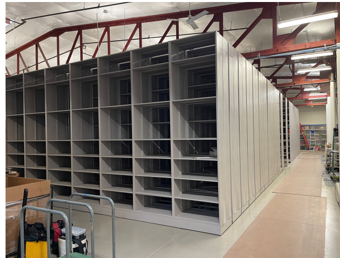
September 20, 2023: Shelving Installation