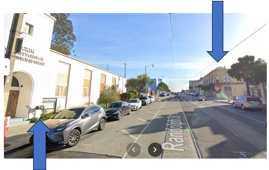
Pilgrim Community Church / IT Bookman Center (not pictured)