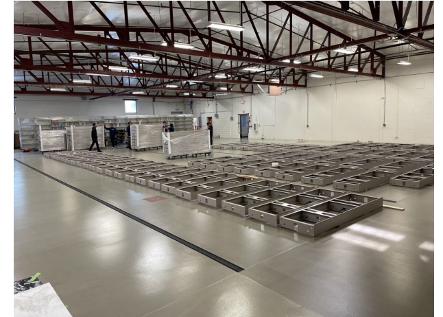
August 14, 2023: Shelving Delivery