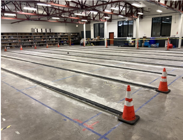
May 1, 2023: Shelf Rails Install