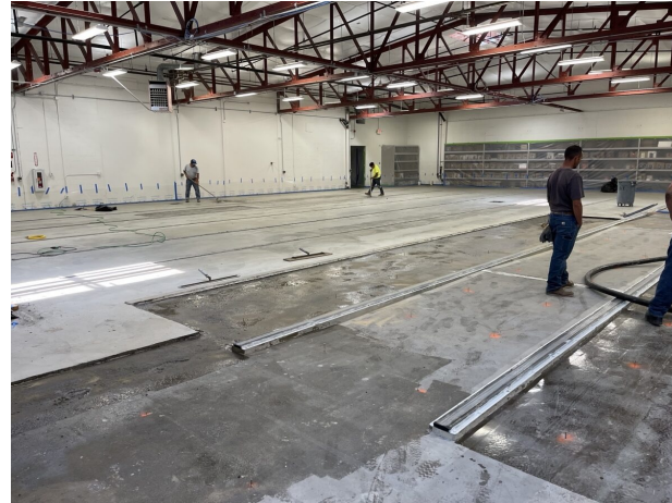
July 31, 2023: Floor Fill Install Start