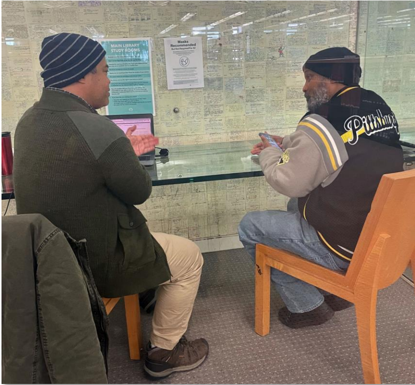
Smart Money Coaching at SFPL

“Thank you so much for making this hugely invaluable resource available to the community. Hope you all know how much it is appreciated, and the positive difference it has made!”