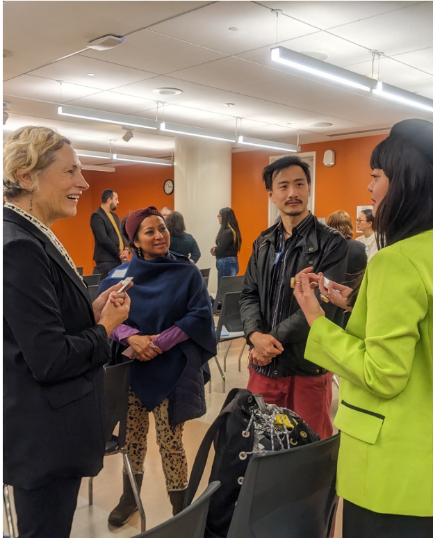
Coffee & Community

"The library's support is invaluable . It helps new entrepreneurs take the steps on their roadmap to being small business owners and [...] build confidence on this journey."