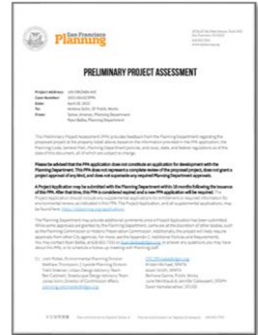
Preliminary Project Assessment April 2022

Pause of non-essential capital projects 2020 – 2021 (COVID-19 Pandemic)