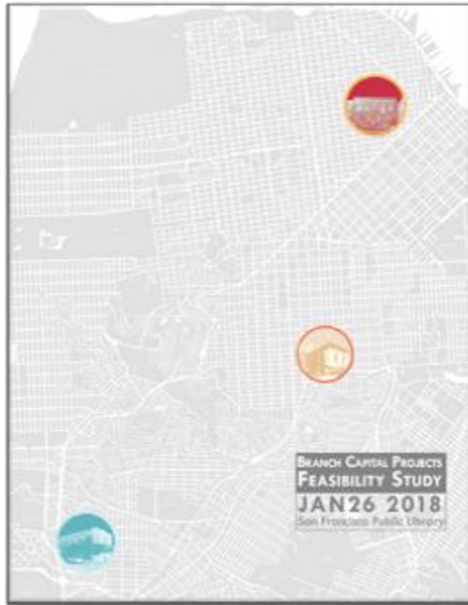
Branch Capital Projects Feasibility Study January 2018