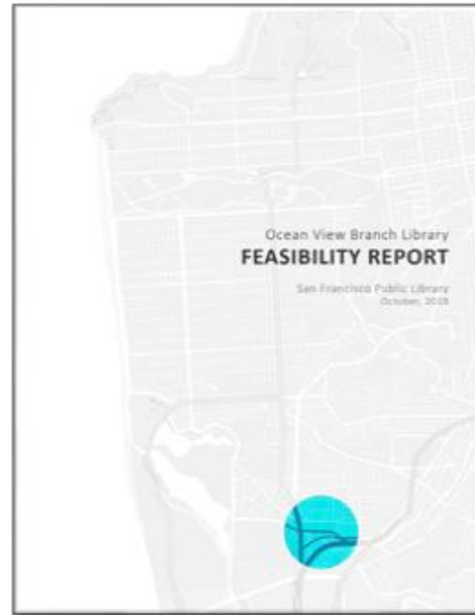
Ocean View Branch Library Feasibility Report October 2019

Pause of non-essential capital projects 2020 – 2021 (COVID-19 Pandemic)