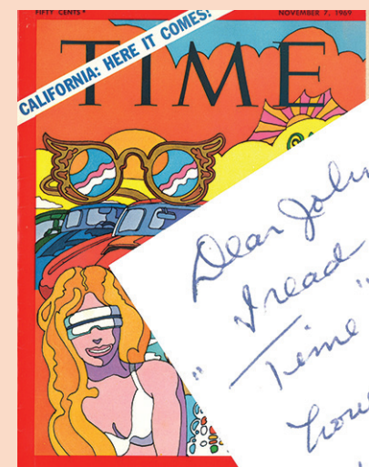
Cover of Time , Nov. 7, 1969, with response.

Streaming Video Party Main, Learning Studio - 5th Fl, 3-4 p.m.