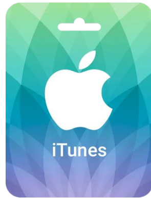
Added Additional Prizes for Top 25 Participating Locations