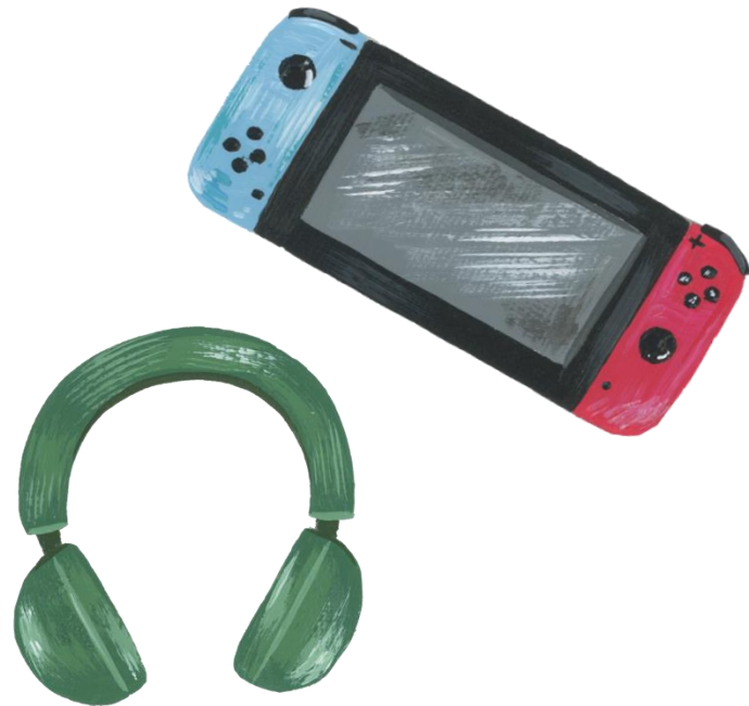
Offered Big-Ticket Raffle Prizes