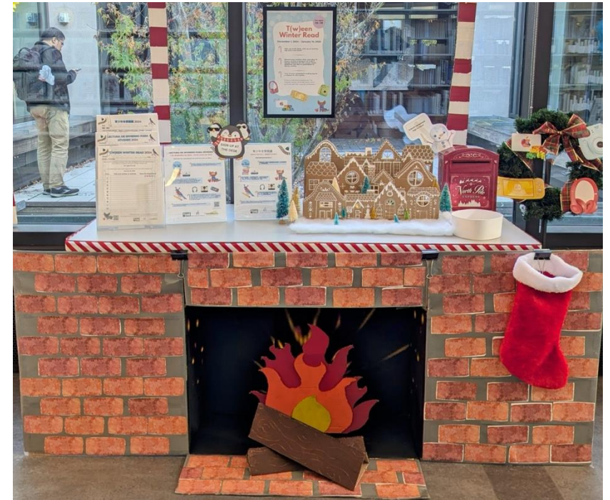
Moved to In-Person Only for Sign-ups and Completions