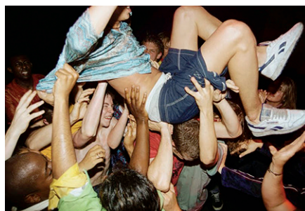
Photograph by Elaine Constantine as reproduced in Dpict magazine, November 2000, p. 41.

Exhibition: Sidewalk Stories: San Francisco, 1970s–1980s – May 22–July 16, Main Library, San Francisco History Center exhibition space, 6th Floor