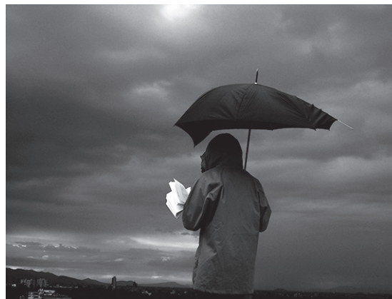
Z, 2025.

Exhibition: De Natura Libris: The Physical and Abstract Life of Books – May 15–July 30, Main Library, International Center, 3rd Floor