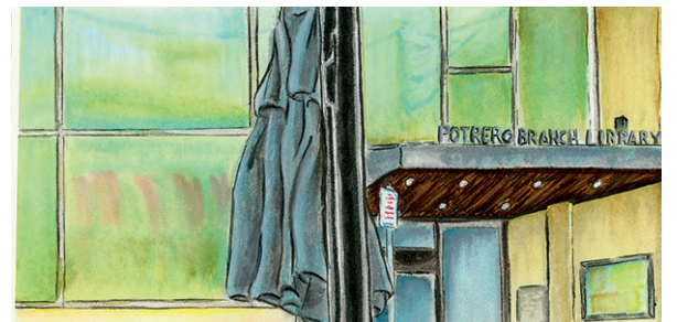
Watching the Library, acrylic brush pens, 2025.

Opening Reception – May 9, 6 p.m., Potrero Branch