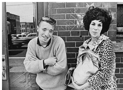
Photograph by Ingeborg Gerdes, San Francisco Camera, Collection of photographs from San Francisco State College No. 1, Jan. 1969.

will highlight the explosion of print photography across publications including little magazines, underground newspapers and independently produced journals. Photography ranging from artistic to journalistic will be displayed, all sourced from our Book Arts and Special Collections and the San Francisco History Center. Sidewalk Stories: San Francisco, 1970s–1980s opens soon after, featuring archival photographs by photographers whose works are housed in our San Francisco History Center collection.