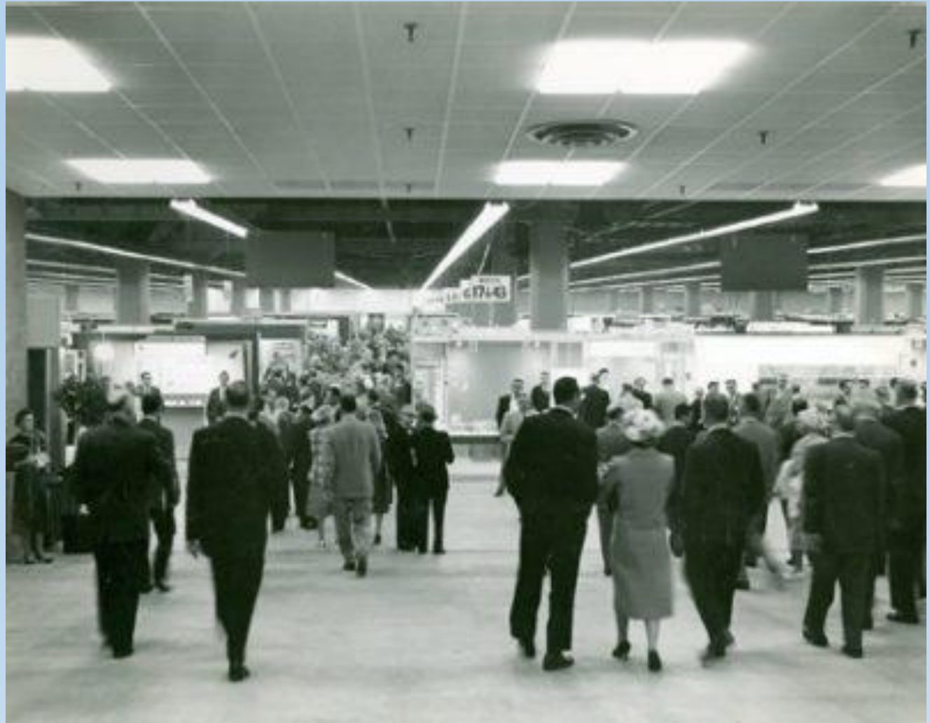
1959 -- Exhibit Hall -- Brooks Hall