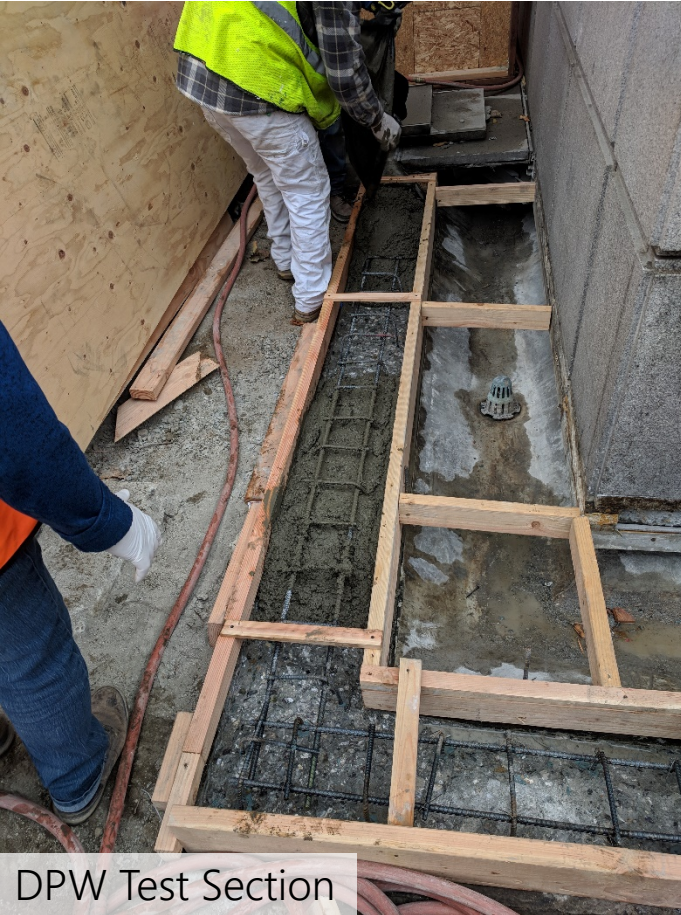
DPW Test Section