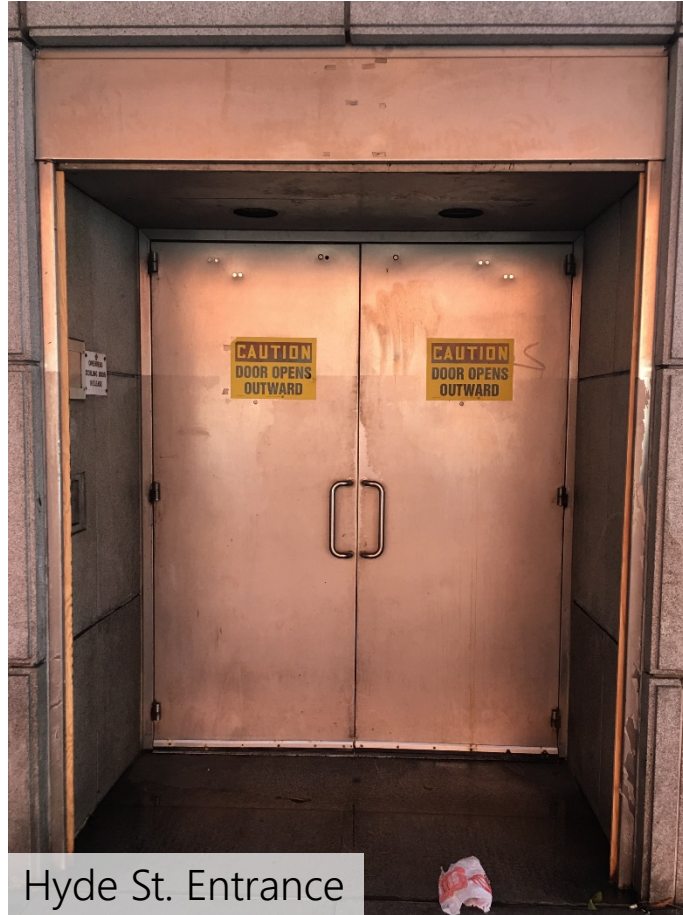
Hyde St. Entrance