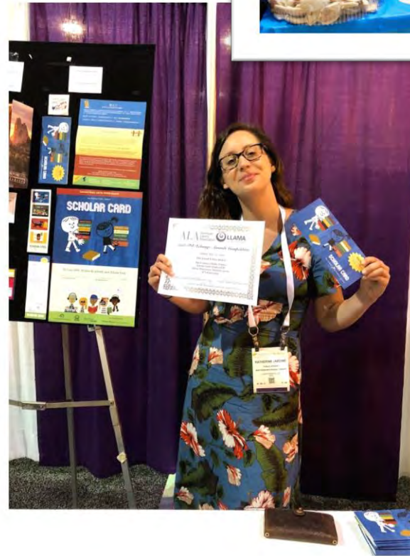
Conference Attendance & Presentations