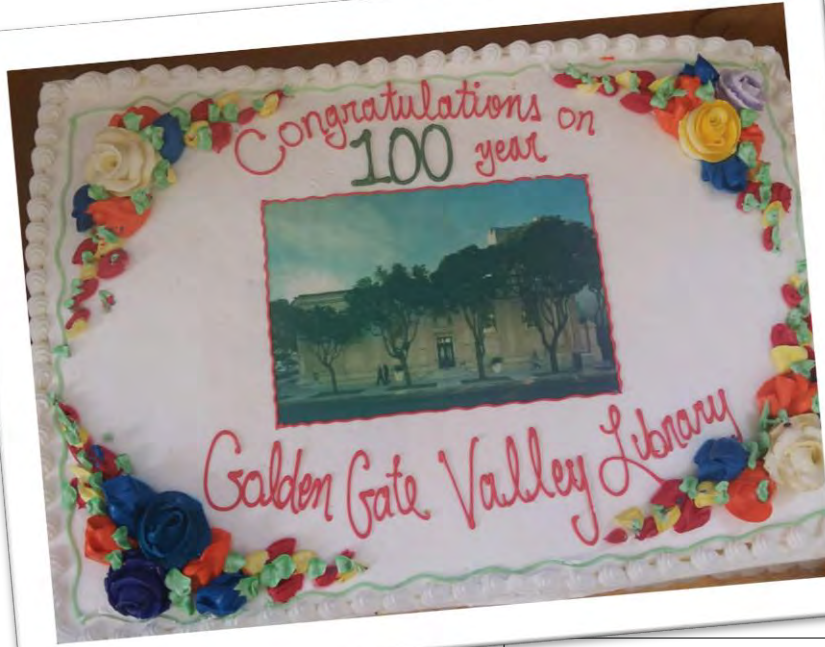
Branch Open Houses