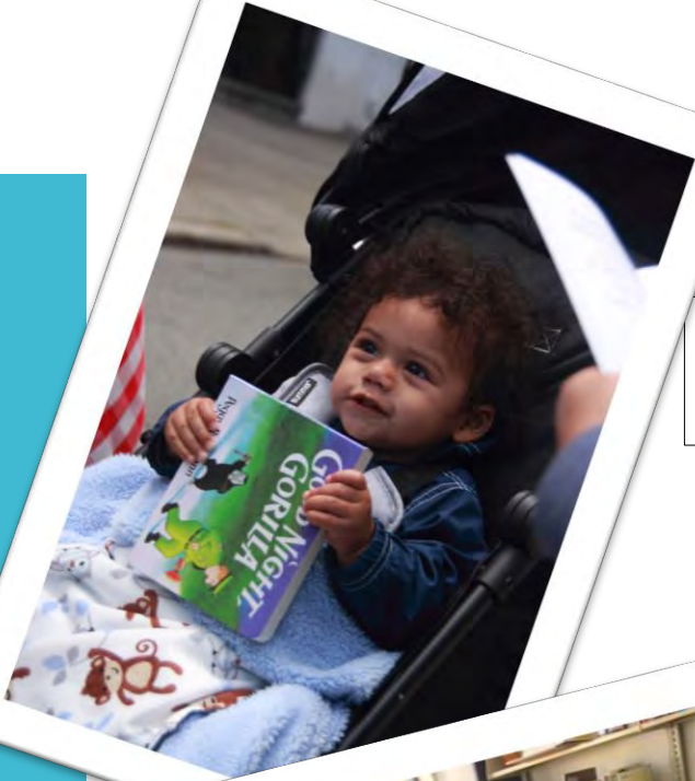
Dia de los ninos