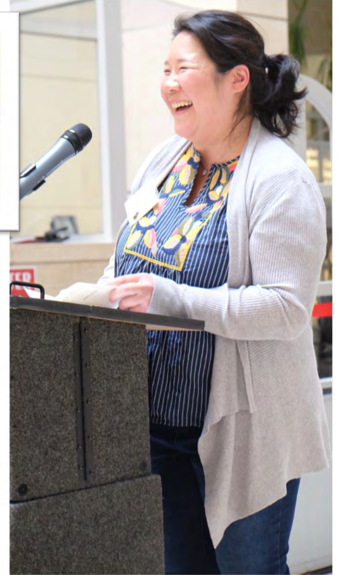
Staff Recognition Awards