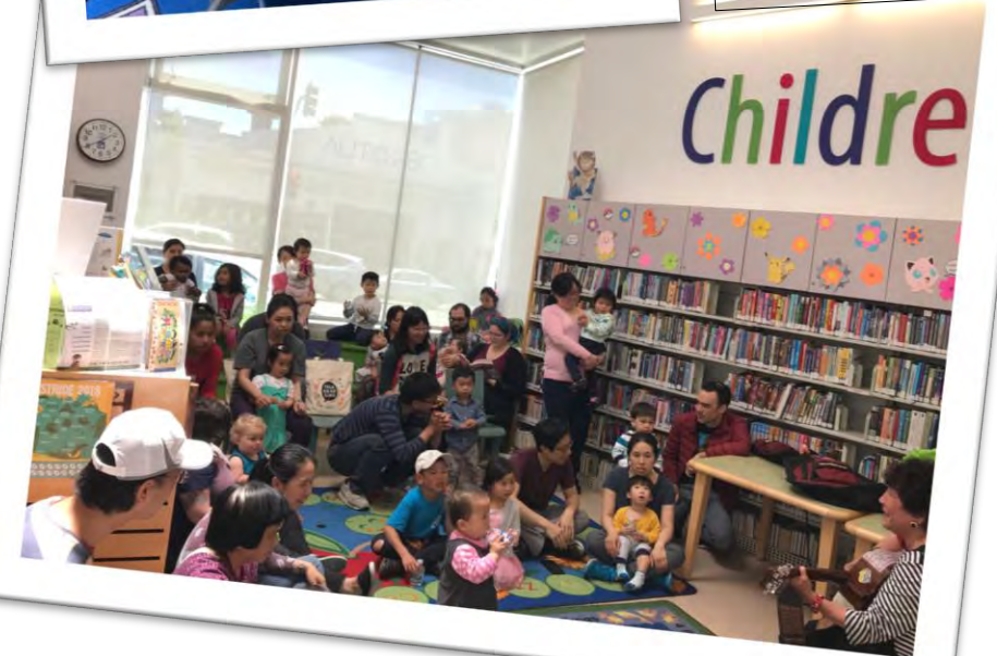
Community Baby Shower