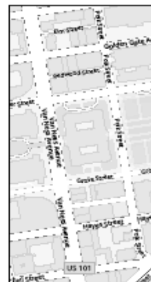
San Francisco Public Library Branch Map