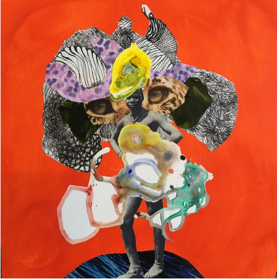
Kenyatta A. C. Hinkle The Arrival (2016) Yupo Paper, cotton paper, and acrylic paint, panel