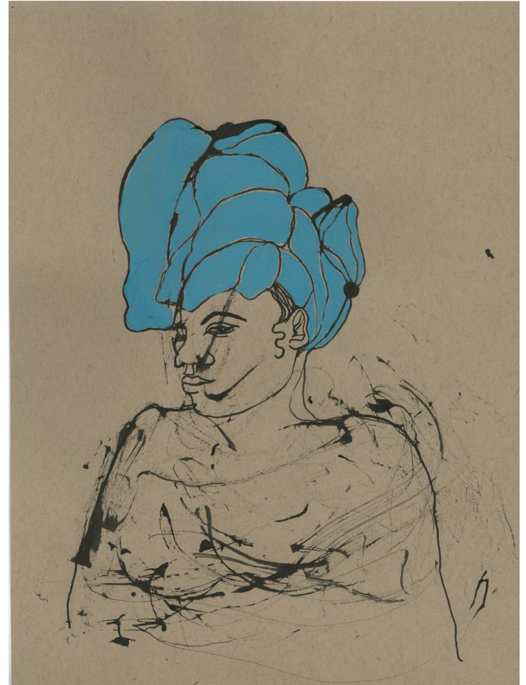
Kenyatta A. C. Hinkle The Evanesced #8 (2016) India ink and watercolor on recycled, acid-free paper