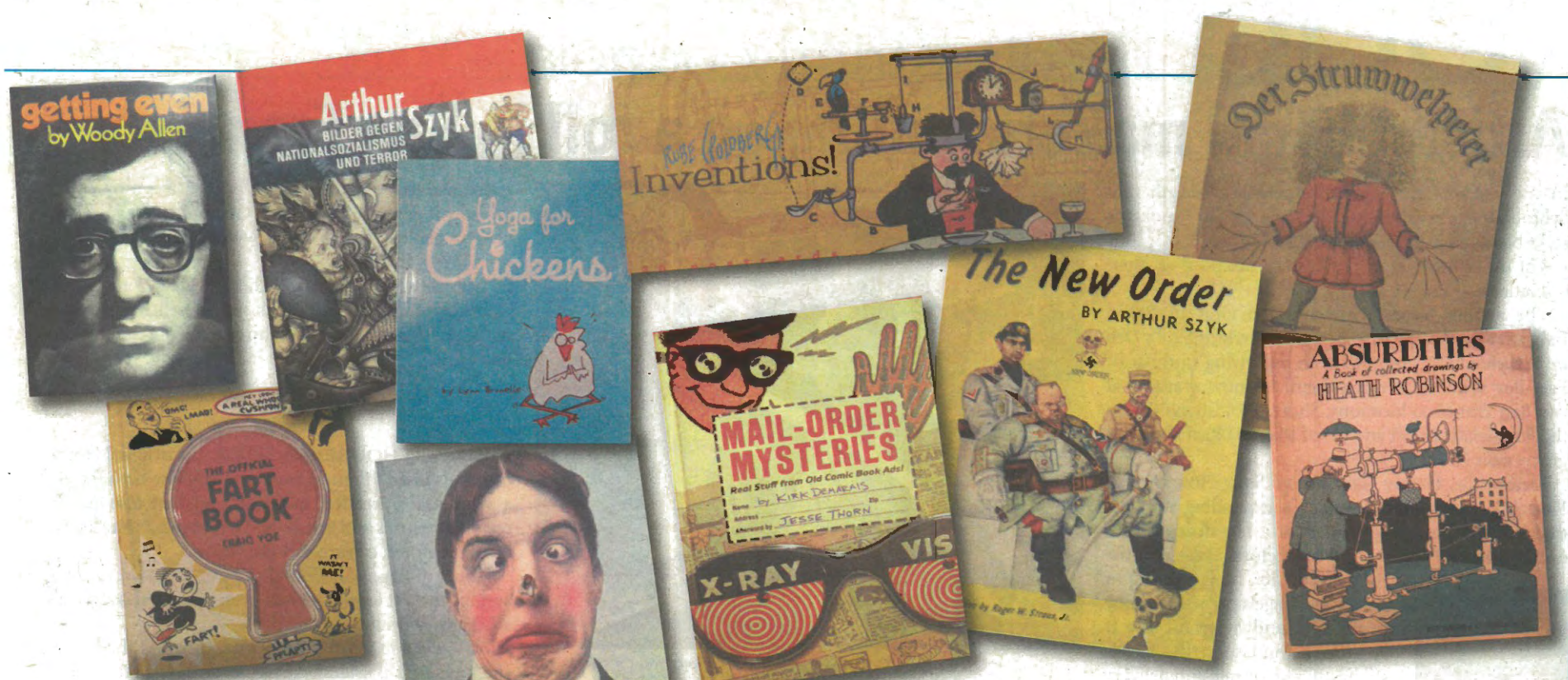
A sampling from the collection's 22,000 volumes