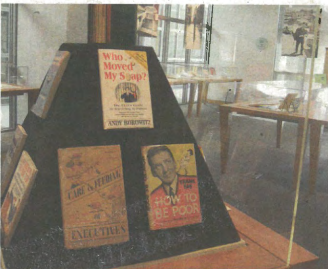
One of the displays in this year's Schmulowitz Collection of Wit and Humor exhibit